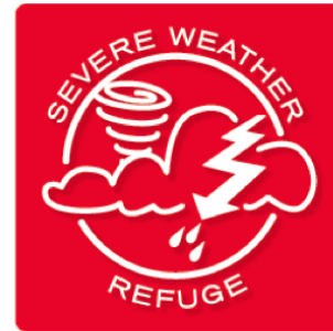
This symbol designates each building's safety refuge.

My friends are able to contact my family in an emergency, if I am unable.