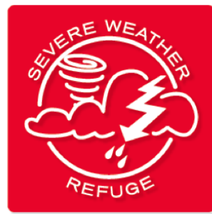
This symbol designates each building's safety refuge.

My friends are able to contact my family in an emergency, if I am unable.