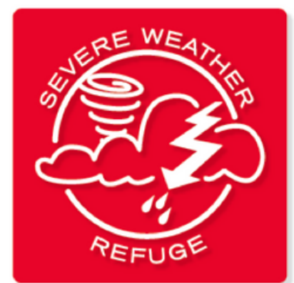
This symbol designates each buildings safety refuge.

Cellular phone reception may be limited during emergencies, Use text messaging or social media to contact friends and family.